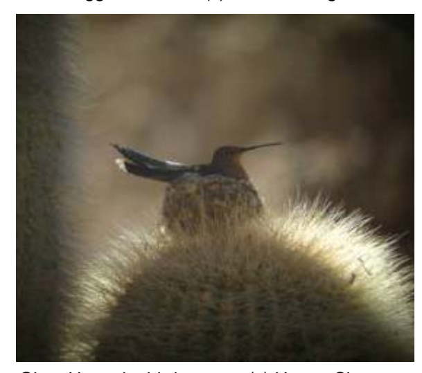
Giant Hummingbird on nest