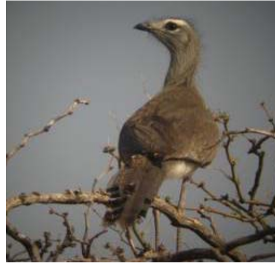
Black-legged Seriema