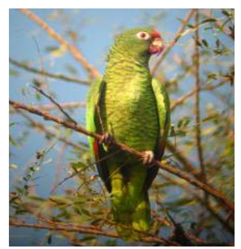
Alder Parrot