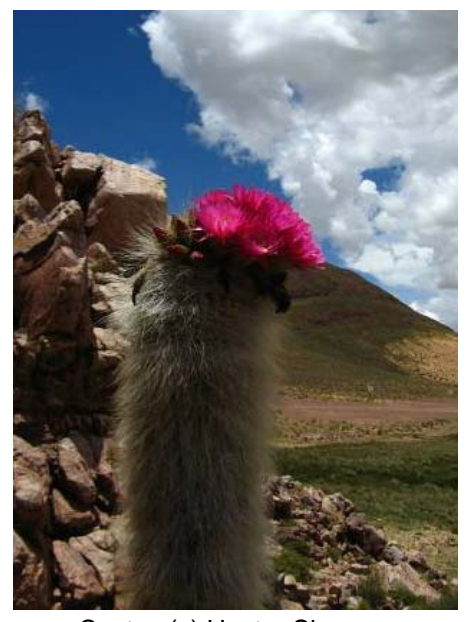
Cactus (c) Hector Slongo