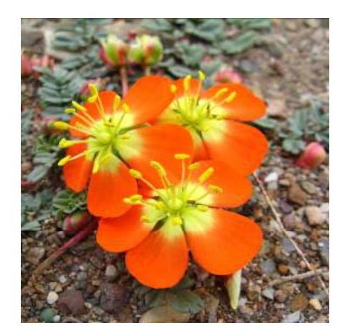
Andean Flower